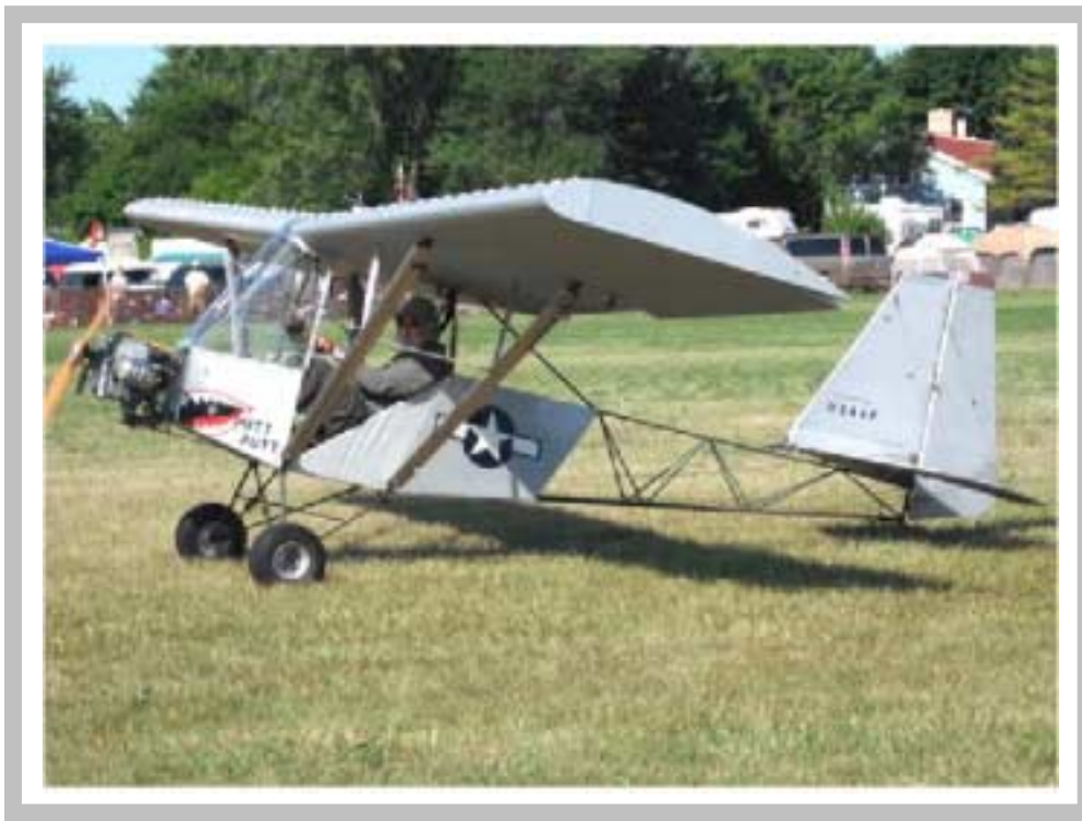
Joe Spencer's Putt-Putt at OSHKOSH '09