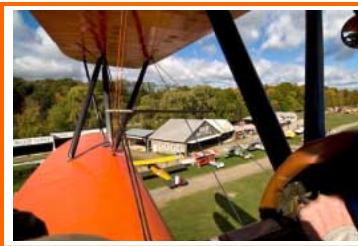
At left, cool view of Old Rhinebeck Airdrome

Cockpit Clutter Experimental Aircraft Association Greater Pittsburgh EAA Chapter 45 2 Airport Road Belle Vernon, PA 15012 Address Service Requested