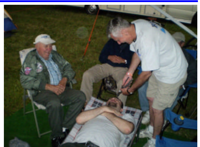
Either this is campground dentistry or it is something that I don't want to know...